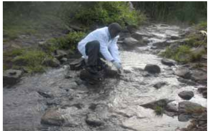
Fig. (1). Collection of samples from one of the tributaries in the upstream of River Kandutura.

A total of 510 water samples were collected; 255 from the river at upstream, midstream and downstream of river Kandutura and another 255 randomly collected from community tap water (Figs. (1-4)). These samples were transported at low temperatures to the laboratory and were analyzed within eight hours of collection. For microbial analysis, 100 ml samples were filtered using membrane filters (Whatman GmbH, Germany), pore size 0.45µm, 47 mm diameter. The isolation and identification of microorganisms were performed following the standard microbiological technique recommended by Quinn et al. [11]. The filters were aseptically inoculated onto solidified nutrient agar media and incubated at 37 °C for 48 h for isolation of E. coli . Some of the filters were placed on trypticase soy Agar (Oxoid) and incubated at 37 °C for 24 h to determine the total heterotrophic counts. For isolation of Shigella and Salmonella , the filters were enriched with