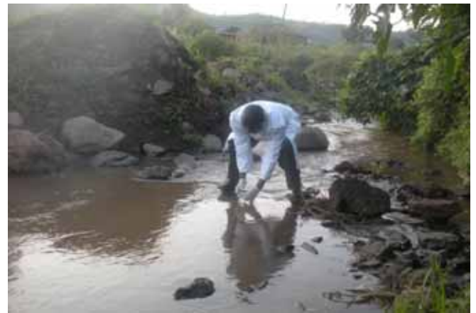
Fig. (2). Collection of samples from the midstream of River Kandutura.