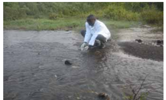
Fig. (3). Collection of samples from the downstream of River Kandutura.

Selenite F broth followed by careful streaking on XLD agar [12].